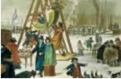
Frost Fairs [3]